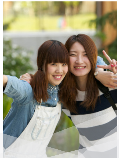
English+ Culture students enjoying their time!