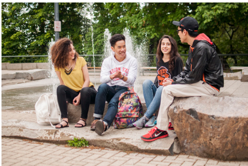
Many opportunities to engage and converse with other students!

Due to the educational nature of this program, we are not able to accept B Tourist Visas. Students will be part of an intensive language program, which cannot be considered tourism based on U.S. government regulations.